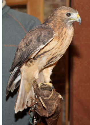
Maverick, Wildlife Ambassador