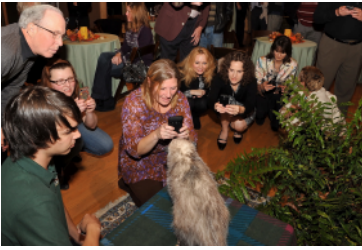
Getting close to wildlife

held November 10 at the Sound Kitchen Recording Studios