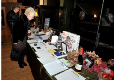
Viewing silent auction items