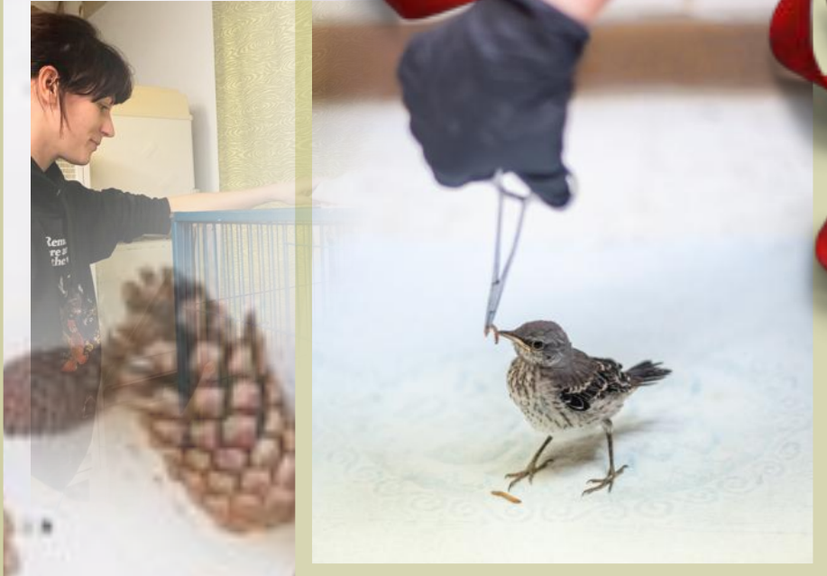
Melody and AC Staff at work

We recently admitted this beautiful warbler. Aren't those colors stunning? There are over 50 types of warblers in the United States, and they are known for making long migrations in the spring! Not often seen at feeders, these birds inhabit forested areas and are skilled insect eaters.