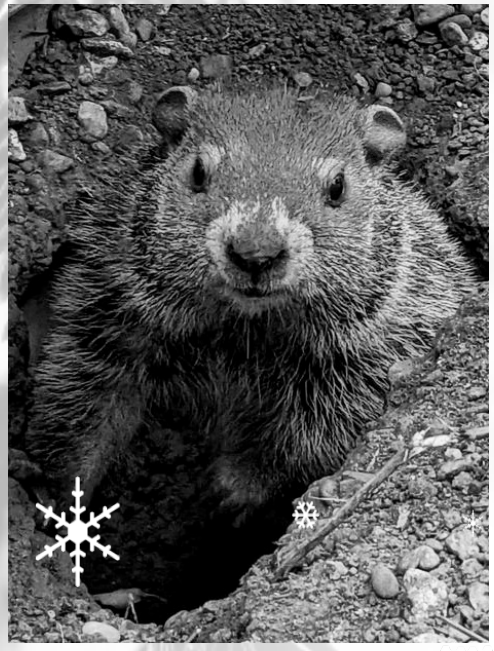
This Groundhog and his littermates, another success story of Walden's Puddle, were released earlier this year!

You can support our Eastern Gray Squirrels' healthy appetites by purchasing nuts from our Wishlist!